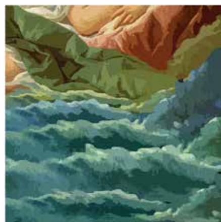
Laurel McKenzie Wall of watery women: versions of venus (detail) 2015, archival pigment print on canvas