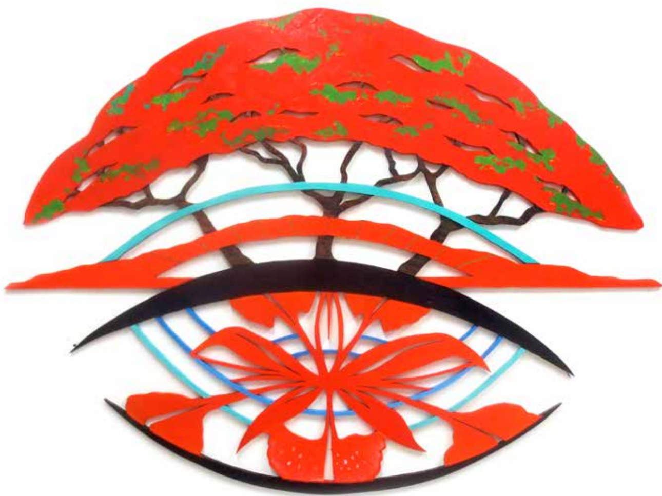
Roland Nancarrow Experiencing the Universe on Martyn Street, (detail - Poinciana 1), 2015, acrylic on PVC and wood