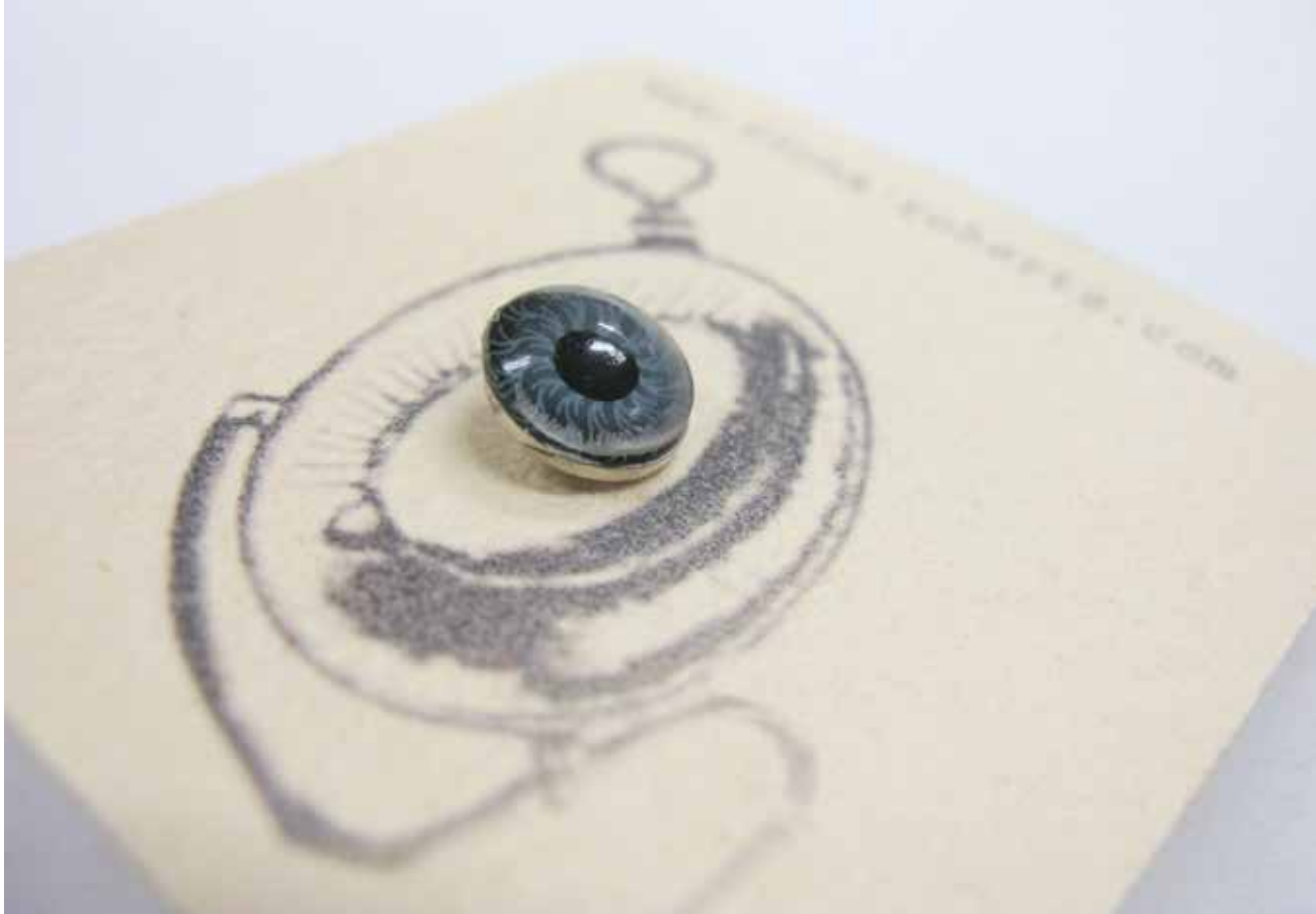
Fiona Roberts, Eye Pin , 2015, KickArts Shop