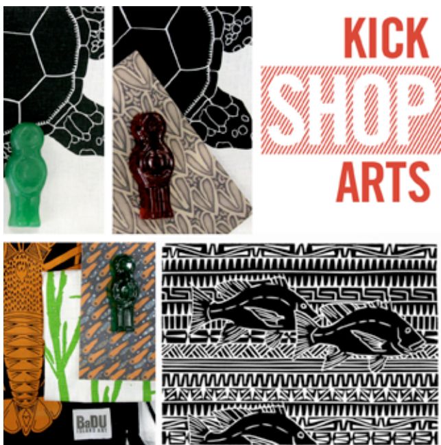
KickArts Corporate Packs

An additional three prints were published under the Djumbunji Press label during 2015. The CIAF editioning project saw Brian Robinson complete two new etchings – Waterworld of Waiben where warual swim through woven waters (2015) & Cowries in a floral landscape (2015). Brian also donated a linocut plate to KickArts featuring the popular Jelly Baby motive - Not Quite Vitruvian (2015).