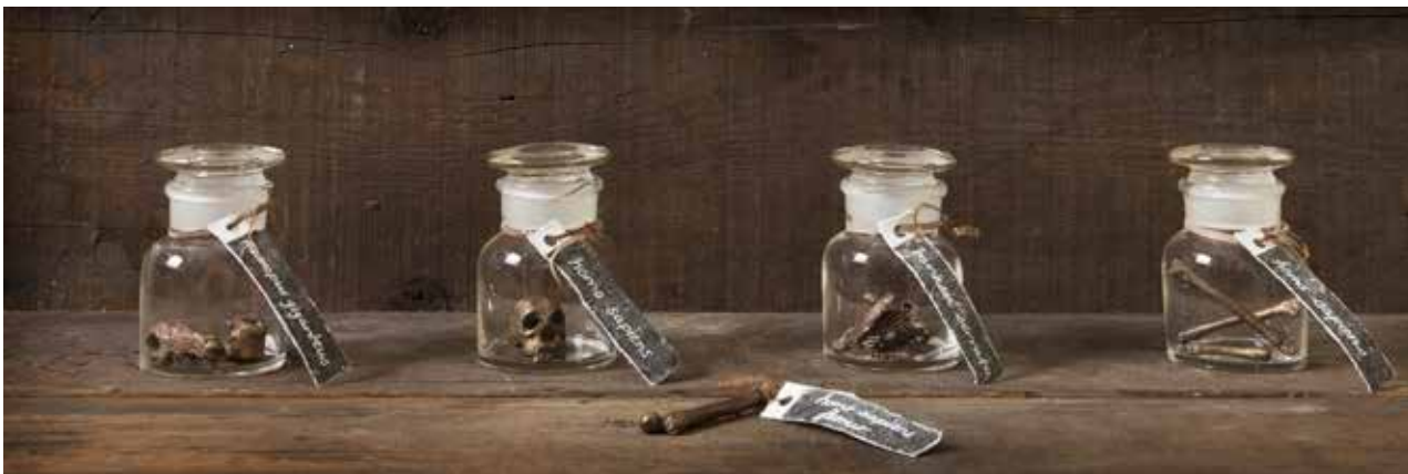
Carol McGregor, Imperial Shaping of Scientific Knowledge , 2011, mixed media