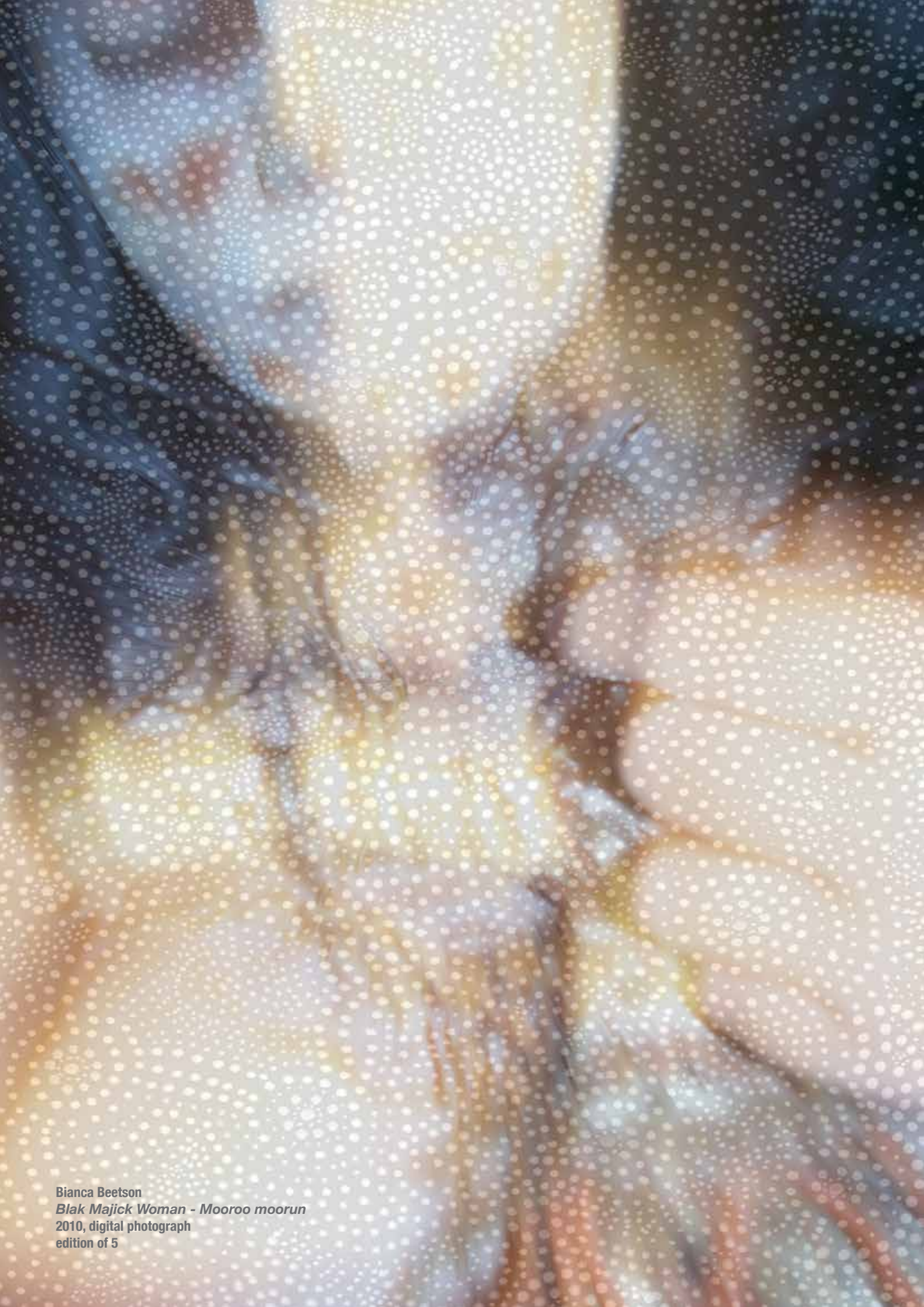
Bianca Beetson Blak Majick Woman - Mooroo moorun 2010, digital photograph edition of 5